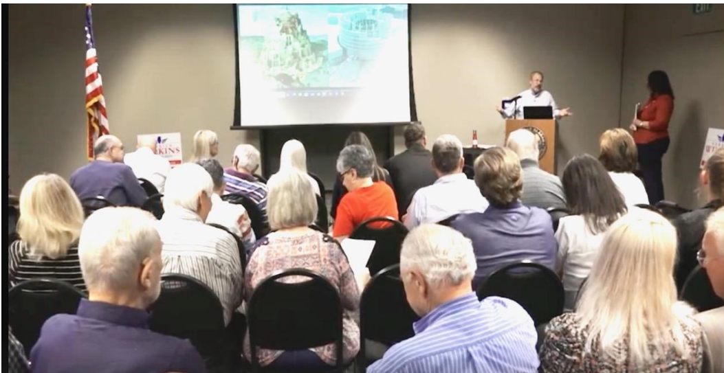
Eagle Forum Trussville meeting about The Great Reset