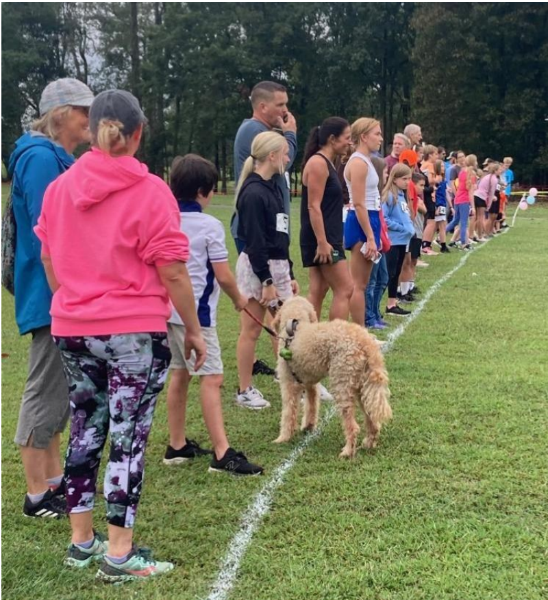
Runners Ready to Start 5K Race to Support Pregnancy Resource Center

After six months of planning and hard work, the Cullman Student Eagles are happy to report that the 2024 Cullman Run For Life was a success! Many local businesses, churches, and individuals helped make the event possible. A total of $7,500 was raised to help support moms and babies through First Source For Women Pregnancy Center. To promote the event, students designed a flyer, built social media pages, created videos, wrote articles, and were interviewed on Cullman Television. They set up a table at Eagle Forum meetings across the state and at local churches several times a week to hand out flyers and speak about the need to take a stand for the pro-life movement.